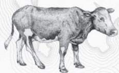
Aubrey Allen Grass-fed, dry-aged British beef