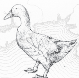
Merrifield Duck Free-range & from a farm where welfare really counts